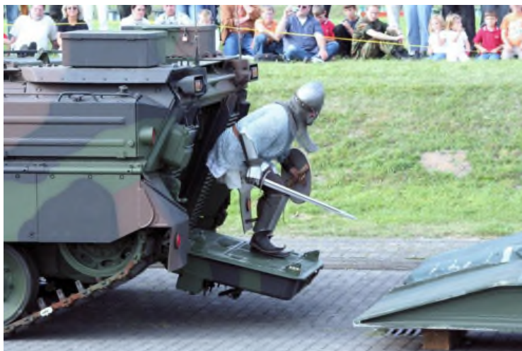
Pay attention to detail.

What happens when you forget to upgrade that one detachment?