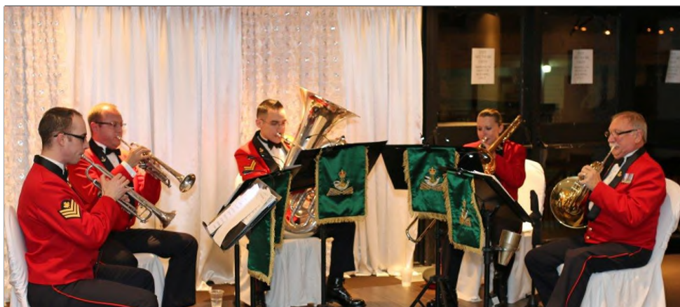
Music for the event was provided by the Royal Hamilton Light Infantry Brass Quintet.