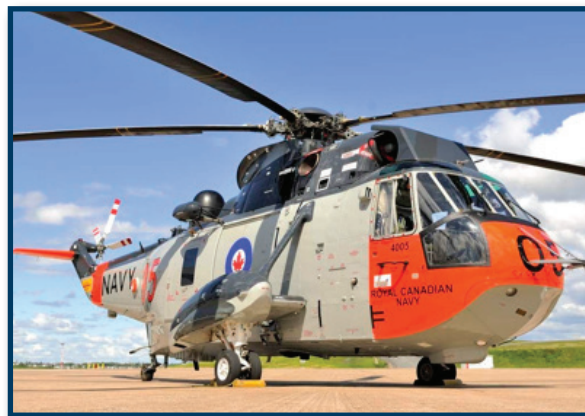
The Sea King celebrates 50 years of service to Canada August '63 – August '13

With the approaching of World War One's 100th Anniversary in 1914, the victory at the Battle of Vimy Ridge, a defining moment for Canada, will be remembered in 2017. This battle was the first time Canadians fought as a national unit as one formation.