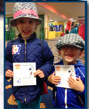
Kids loved getting their thumbprint certificates done by commissionaires in the Kid Zone!