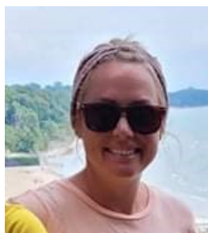
ID Services Assistant

I went to mohawk college to study Finance and accounting. I started my accounting/finance career 30 years ago. I have worked in many industries and have enjoyed my accounting career. I am new to the Security Industry and am enjoying working at Commissionaires Hamilton. The staff are friendly, and very professional. I look forward to the years ahead with my new work family.