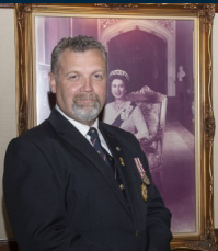
The CEO's Desk

I give thanks for this country of ours – how lucky and blessed we are! I hope this summer affords you all a time to relax and refresh! Happy Canada Day to one and all!