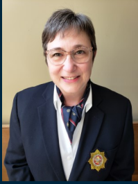
From the Chair

The beginnings of the Canadian Corps of Commissionaires/Le Corps Canadien des Commissionaires go back to 1925 when the government of the day attempted to provide employment for the thousands of First World War veterans who had returned home to find their country had drastically changed. The Corps began as an employment agency. Our mandate has changed very little over time with our vision still being: