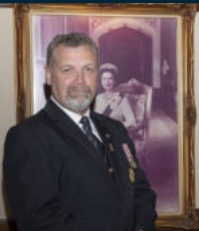
The CEO's Desk

It's the most wonderful time of the year! And what a whirlwind of a year it was. Between shaking off the effects of the pandemic and getting back to a "new normal", to welcoming several new faces to the HQ support team, to recognizing everyone's hard work from 2021 with an historic payroll disbursement, it has been a time of great change for the organization.