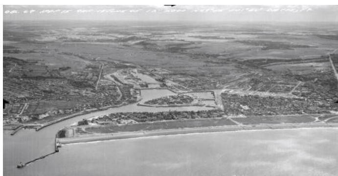
Oblique aerial photograph of Dieppe taken in June 1945, showing the Red beach.

Both sides learned important lessons regarding coastal assaults. The Allies learned lessons that influenced the success of the D-Day landings. Artificial harbours were declared crucial, tanks were adapted specifically for beaches, a new integrated tactical air force strengthened ground support, and capturing a major port at the outset was no longer seen as a priority. Churchill and Mountbatten both claimed that these lessons had outweighed the cost. The Germans also believed that Dieppe was a learning experience and made a considerable effort to improve the way they defended the occupied coastlines of Europe.