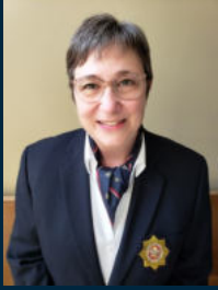
From the Chair