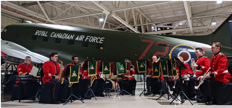
Entertainment for the evening was provided by the Band of the Royal Hamilton Light Infantry.